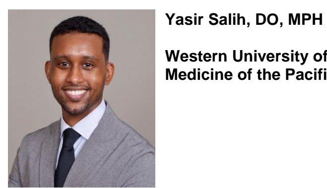
Western University of Health Sciences College of Osteopathic Medicine of the Pacific